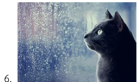
P _ _ _ _ _ _ for rain.