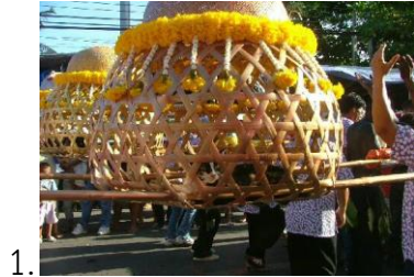
Bamboo or r _ _ _ _ n basket.

Direction: How much do you know about Hae Nang Maew Festival? Look at the pictures; fill in the missing letters in each caption to learn the items.