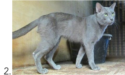
Sisawat s _ _ _ _ _ e cat.