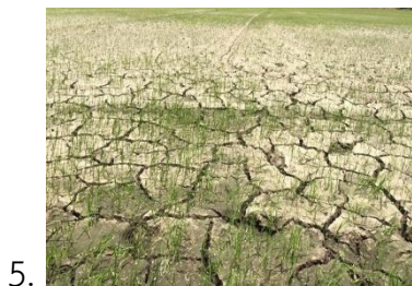
D _ _ _ _ _ t is caused by weather change.