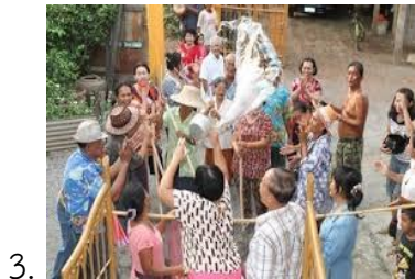
The p _ _ _ _ e moves along through the village.