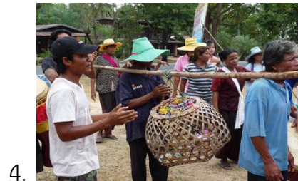
The p _ _ c _ _ _ i _ _ of female cat.